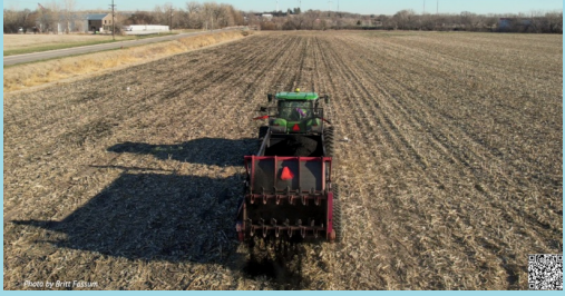
Download this free , 4-page how-to reference which provides practical insights for sourcing and applying biochar to annual and perennial crops.

principles behind using biochar in agriculture. A second factsheet,"'Beyond Application: Learning More about Biochar", will provide further details and is scheduled to appear in the next USBI newsletter!