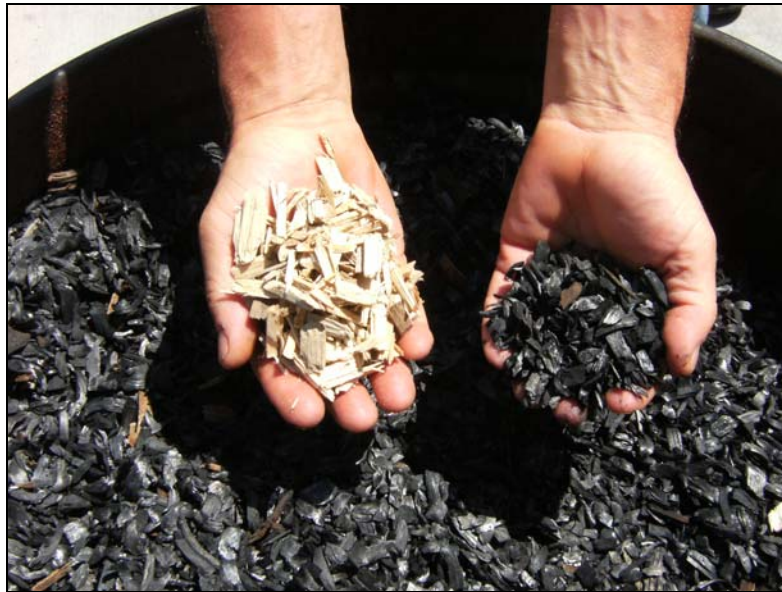
Figure 1. Biochar